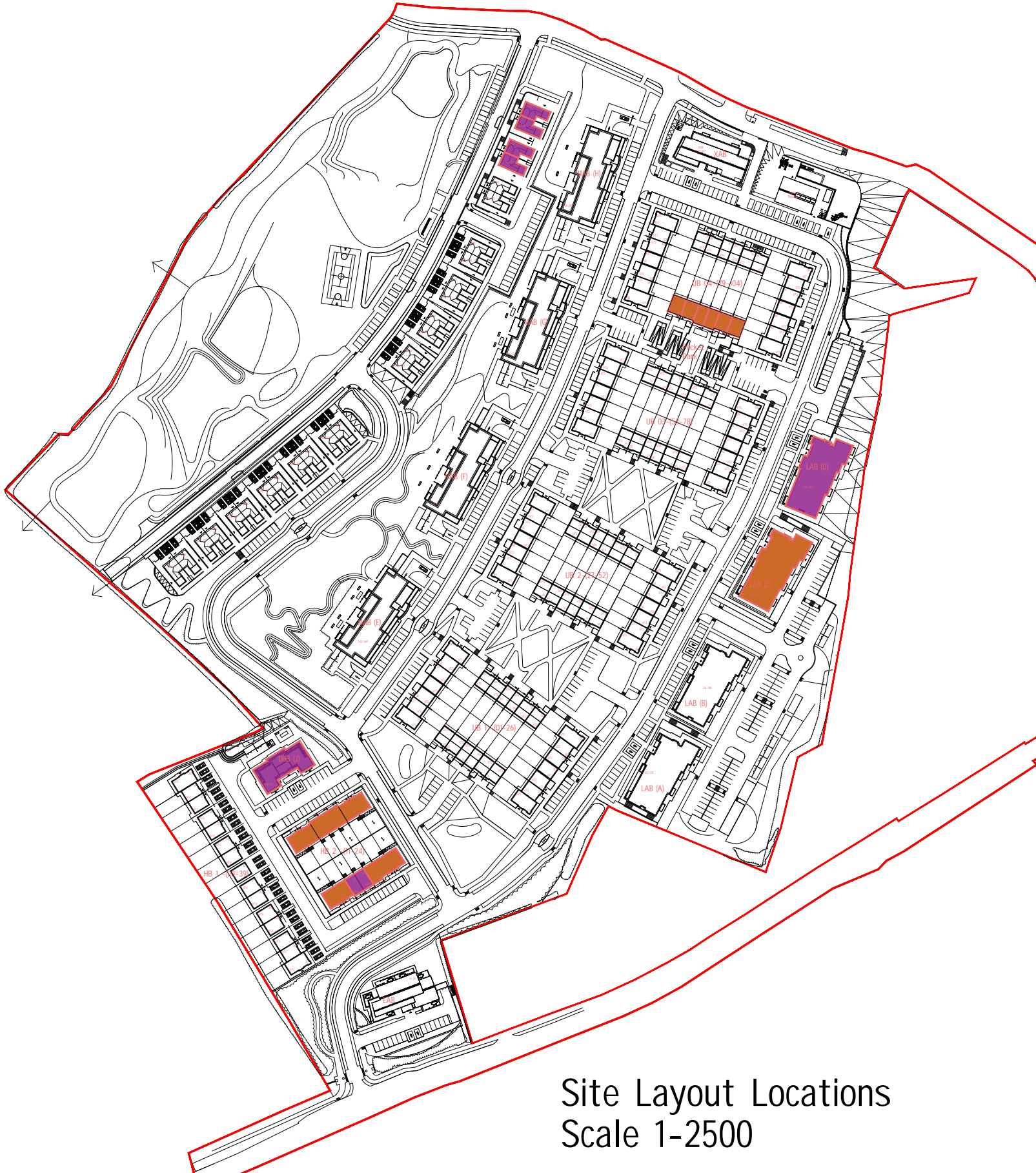
Site Layout Locations Scale 1-2500